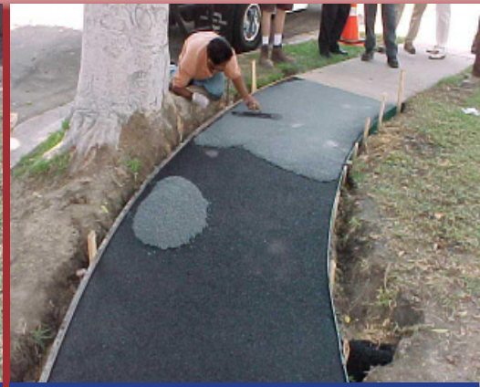
Tire Derived Recycled Content

The Rubberway Rubber Sidewalk Demo Kit™ is supplied to experienced contractors who are interested in learning how to install rubberized permeable paving systems. Kits are sold exclusively to contractors at a low wholesale price to assure a high profit margin.