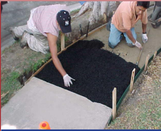
Flexible and Permeable