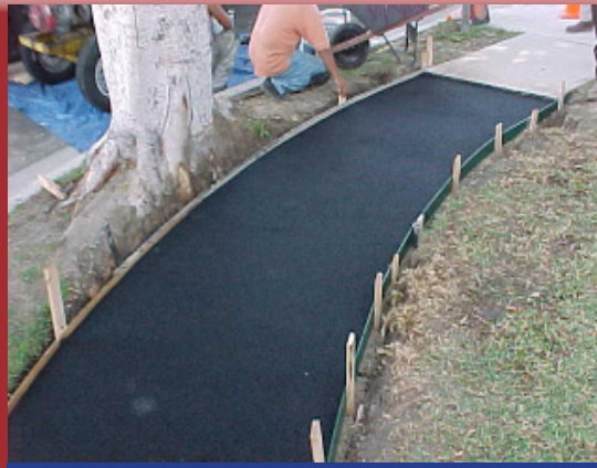
Covers Up to 25 Square Feet